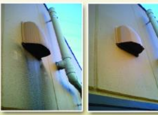
OIL REMOVE, STERILIZATION AND WASH FOR GREASE-FILTER